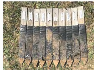
The first samples failed after 8 years