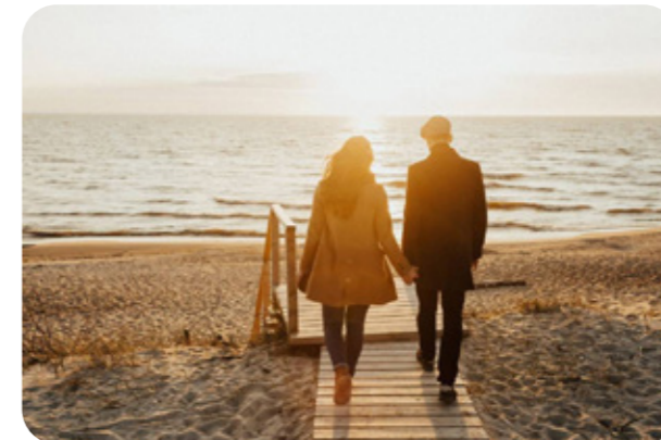
1st Prize: A weekend away for two – a two night stay in an exclusive UK location