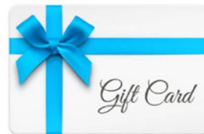
2nd Prize: A £500 high street voucher