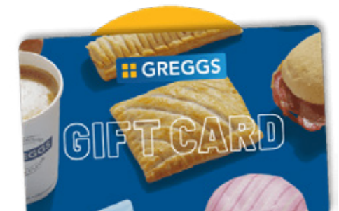
3rd Prize: A £100 Greggs voucher

On top of this, 1st prize will receive a period of paid promotion across social media for their business, as well as a case study and an exclusive listing on our installers map as contractor of the year.